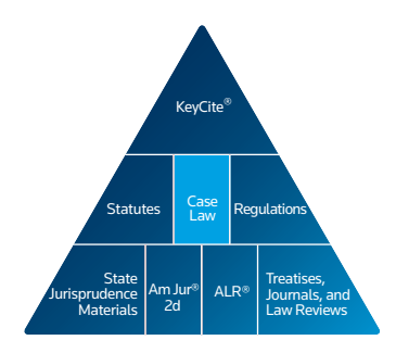
The Westlaw Research Pyramid

For research assistance 24 hours a day, seven days a week, call the West Reference Attorneys at 1-800-850-WEST (1-800-850-9378) or click Help on Westlaw* for a live help session.