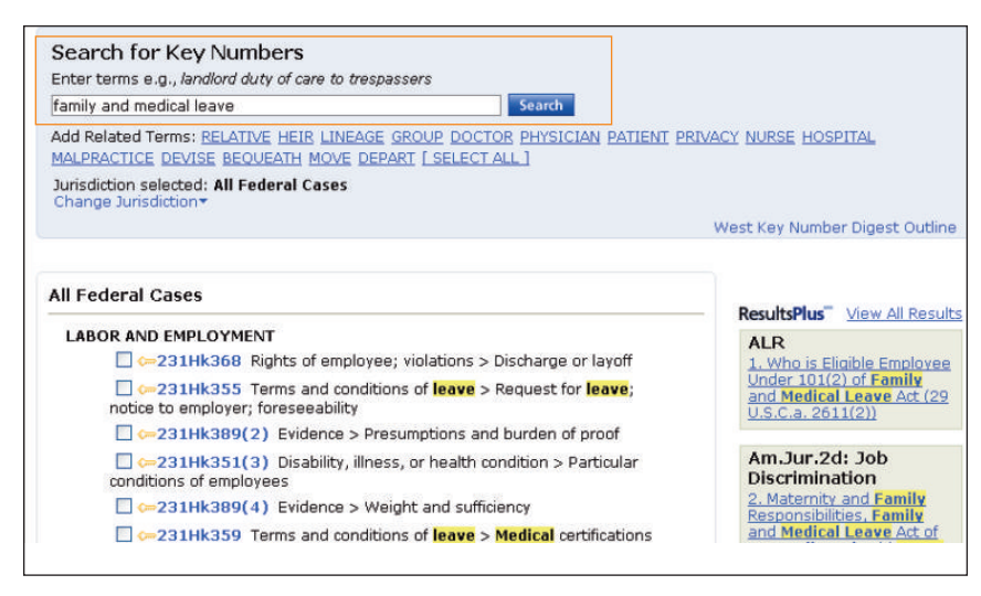
Figure 3. Search for Key Numbers feature

You retrieve a list of topic and key numbers from cases in your jurisdiction (Figure 3), as well as from other state and federal jurisdictions. From the displayed list, click a topic and key number to view the list of case headnotes classified under that topic and key number with links to the full text of the opinions.